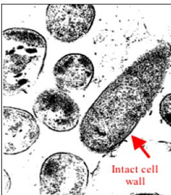
Untreated Notice intact (smooth) cell walls